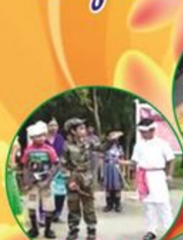
LEARNING BY ACTING