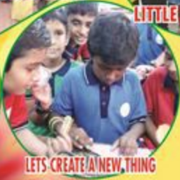
LET'S CREATE A NEW THING