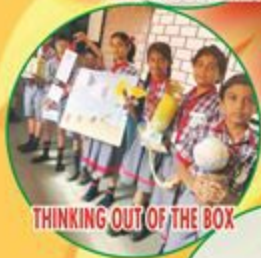
THINKING OUT OF THE BOX