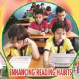
ENHANCING READING HABITS