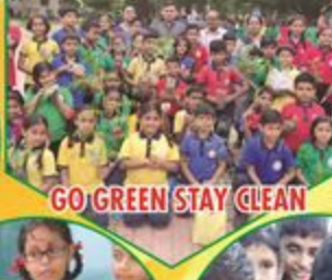
GO GREEN STAY CLEAN