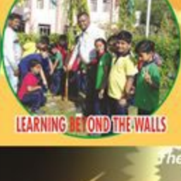
LEARNING BEYOND THE WALLS