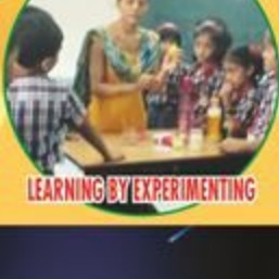
LEARNING BY EXPERIMENTING