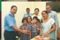
ITA VIDYALAYA NO.1 SECTOR-30

Rakhi celebration was held on 9 th August 2019 in the H.P. Hall. Students from all the classes participated in it. All the girls made attractive rakhis. The students used their creativity and ingenuity to make rakhis. They presented their self made rakhis very beautifully. It was followed by the tying of rakhis by girls to boys. After that boys offered chocolates to girls. The programme was concluded by applying mehndi on hands of the girls by teachers. It was a great experience for girls. They enjoyed a lot.